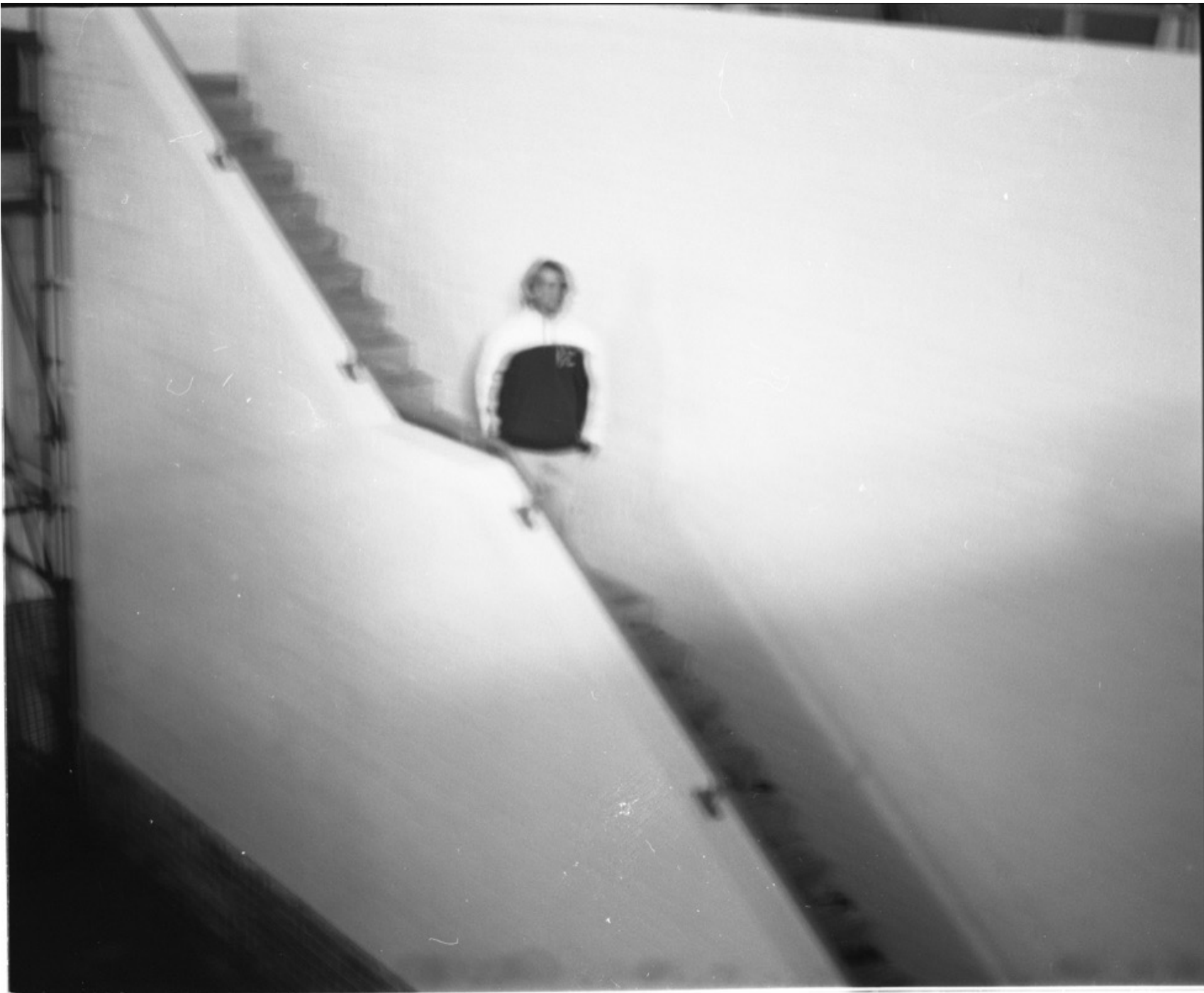
Looking from above