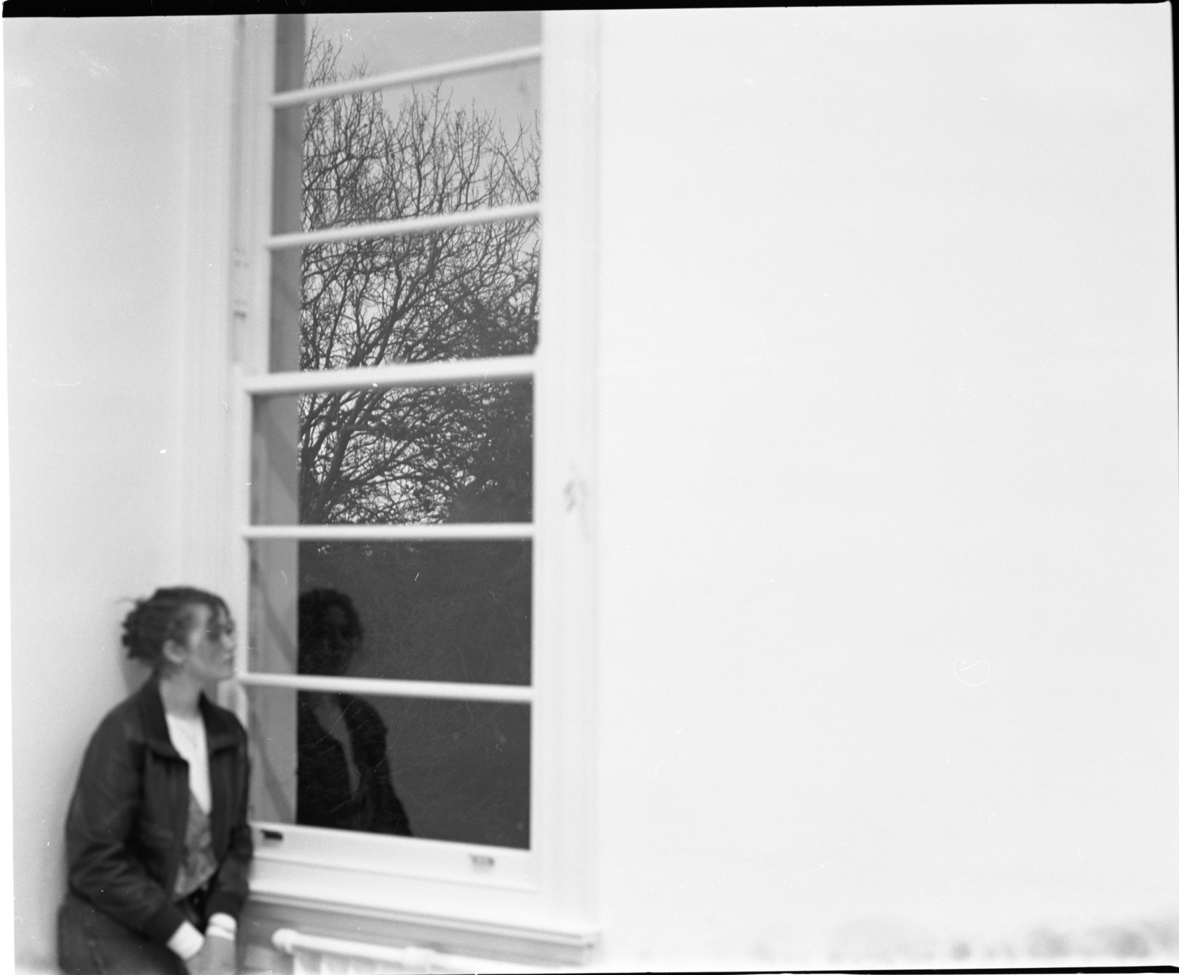
Framed through a window