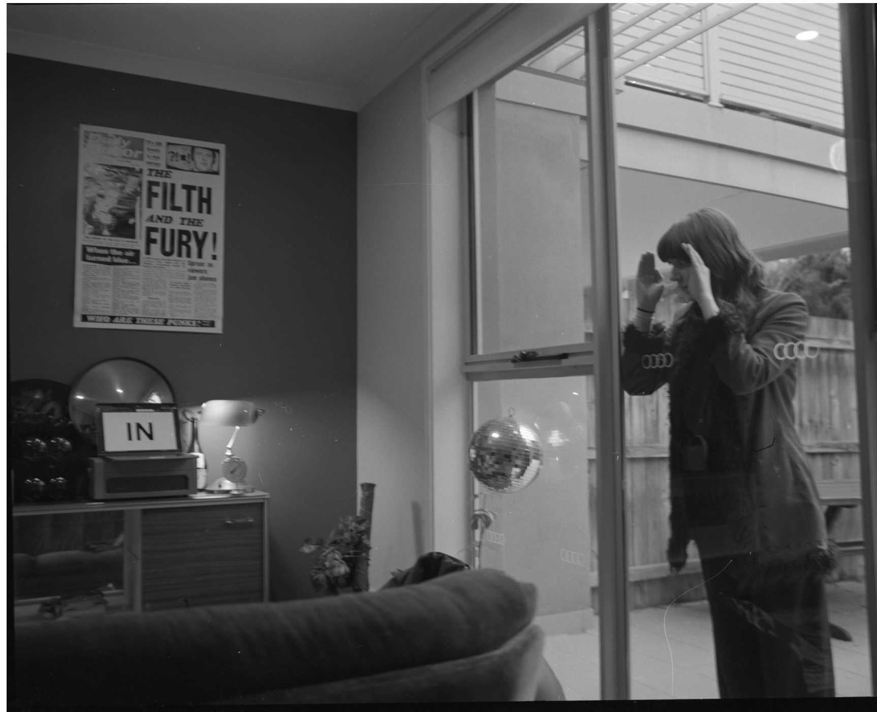
Fictional – Outside looking in