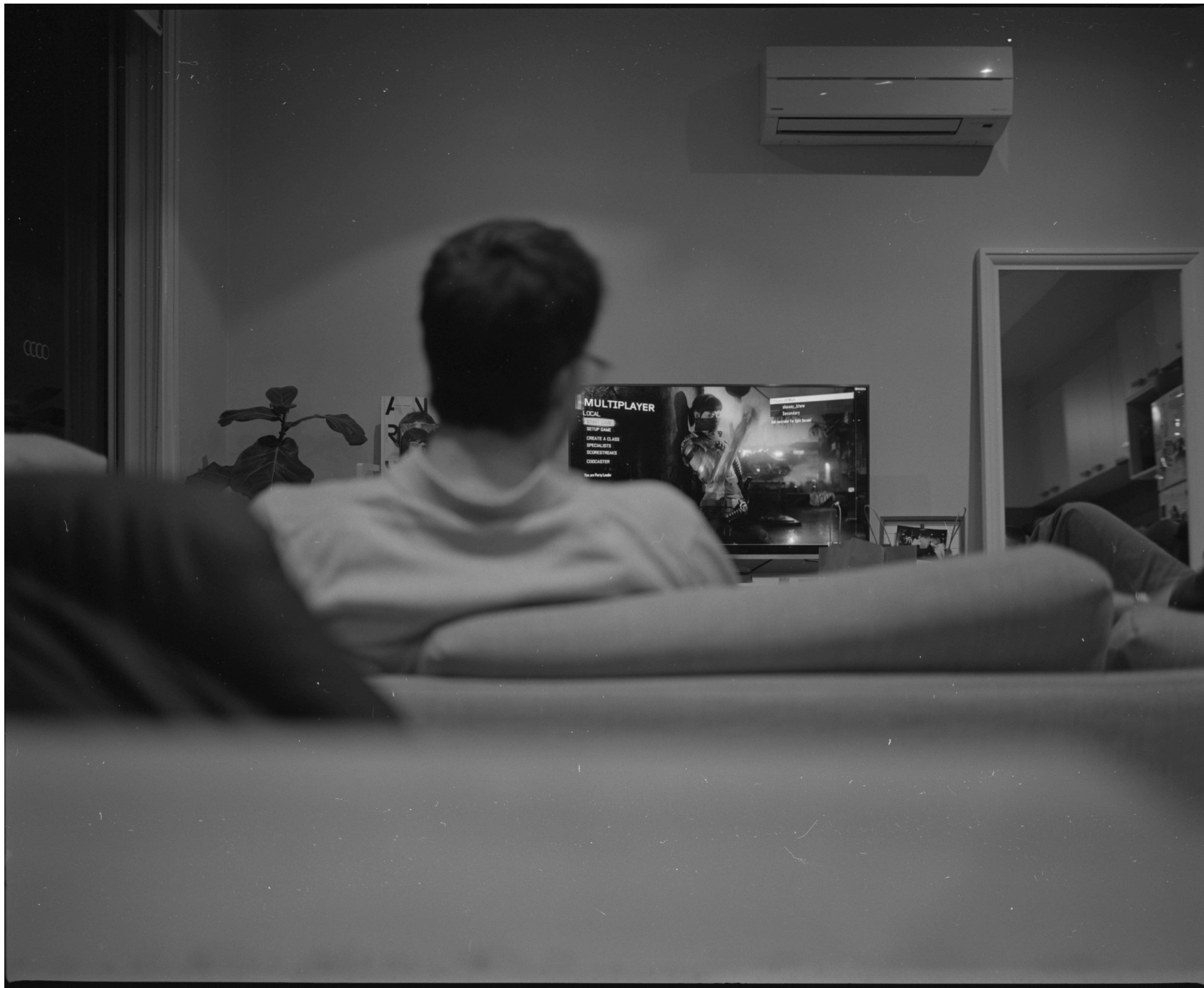
Over the shoulder