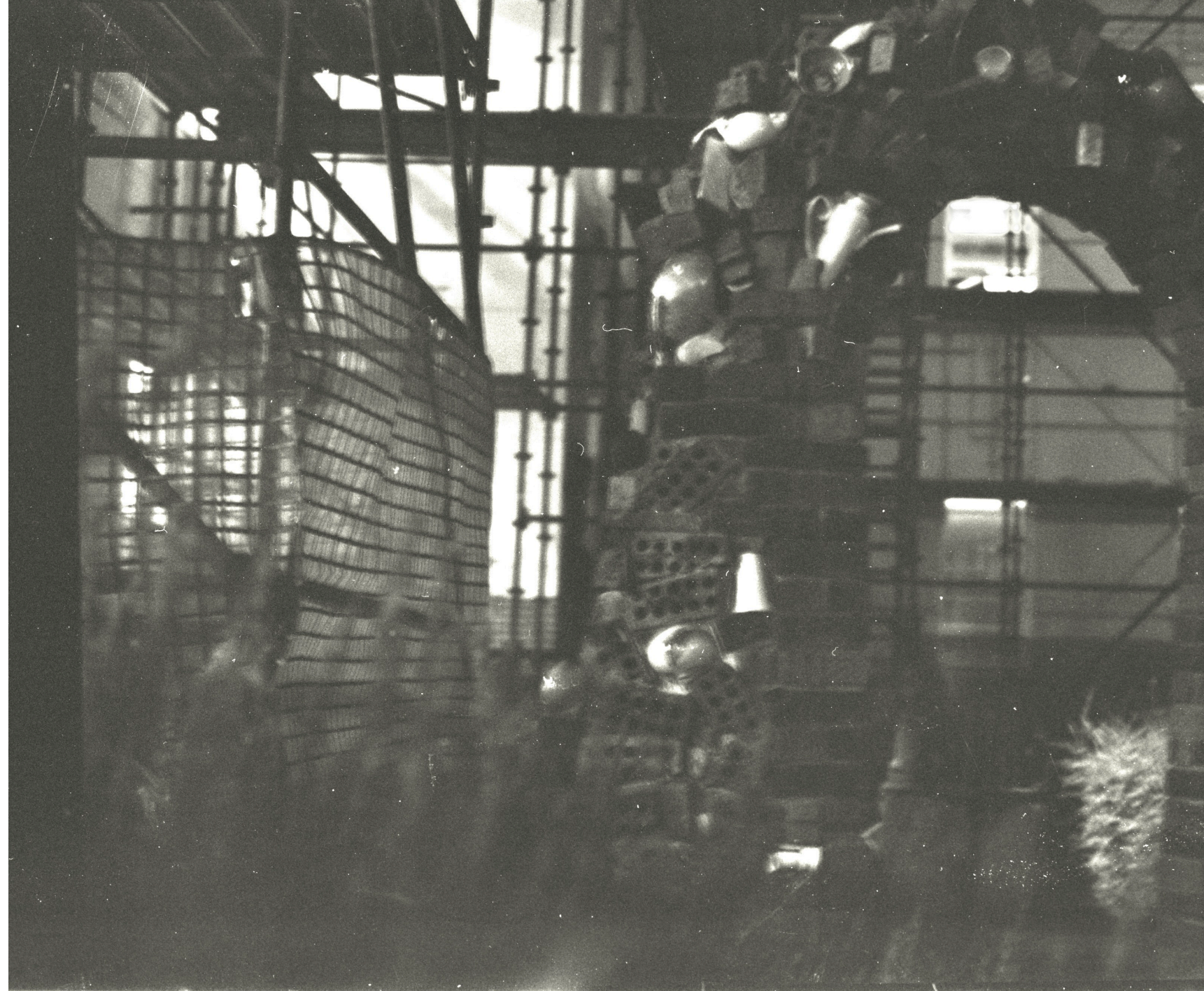
Nature amongst the built environment