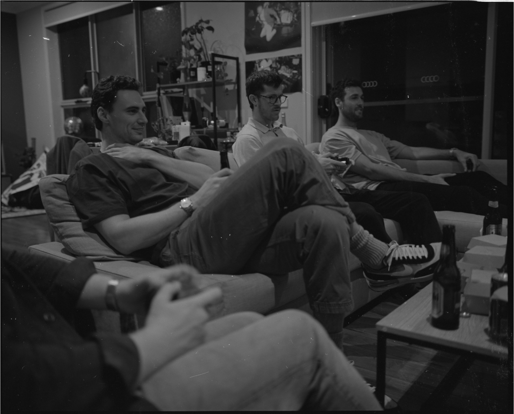
Documentary – Night in