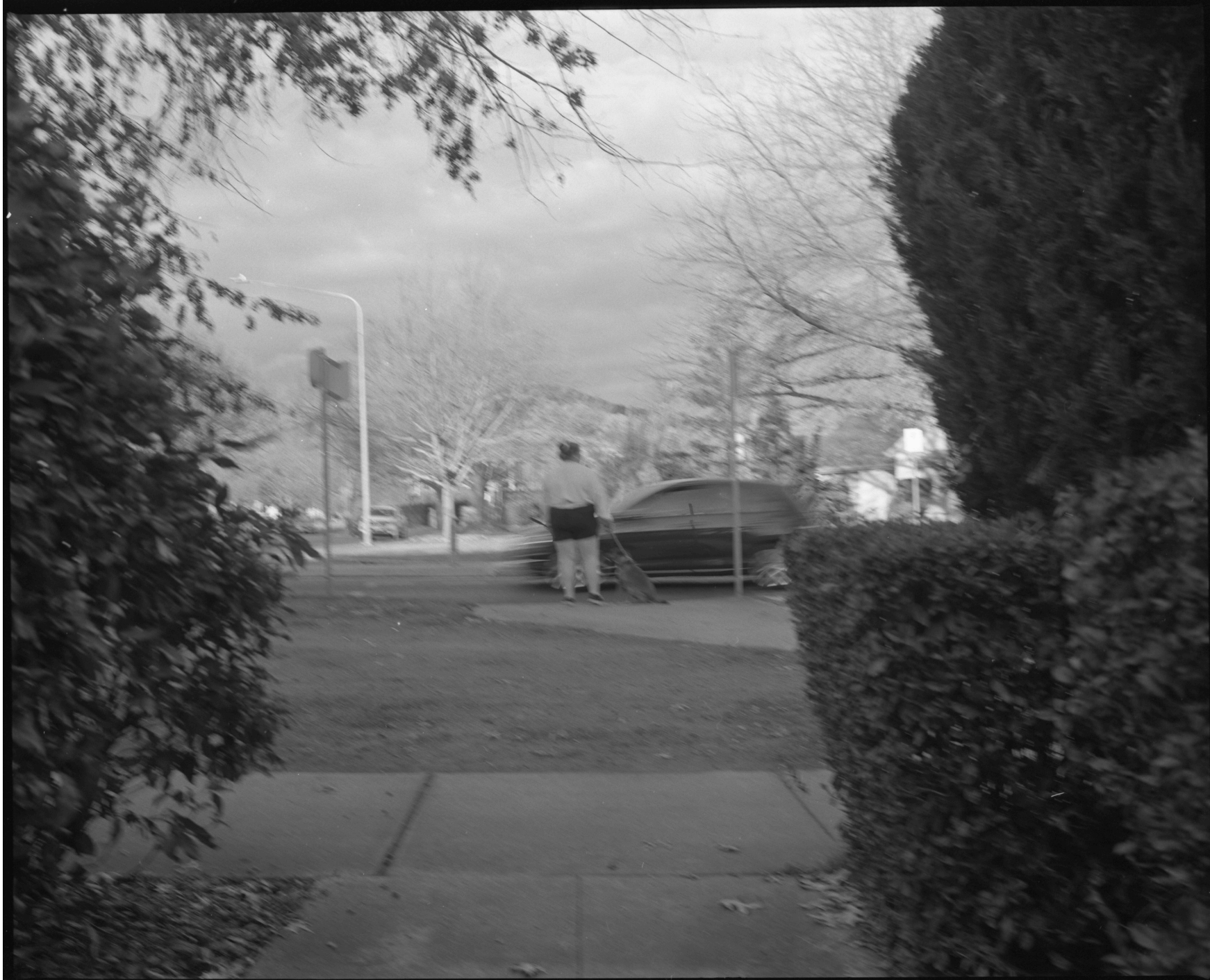
Waiting to cross