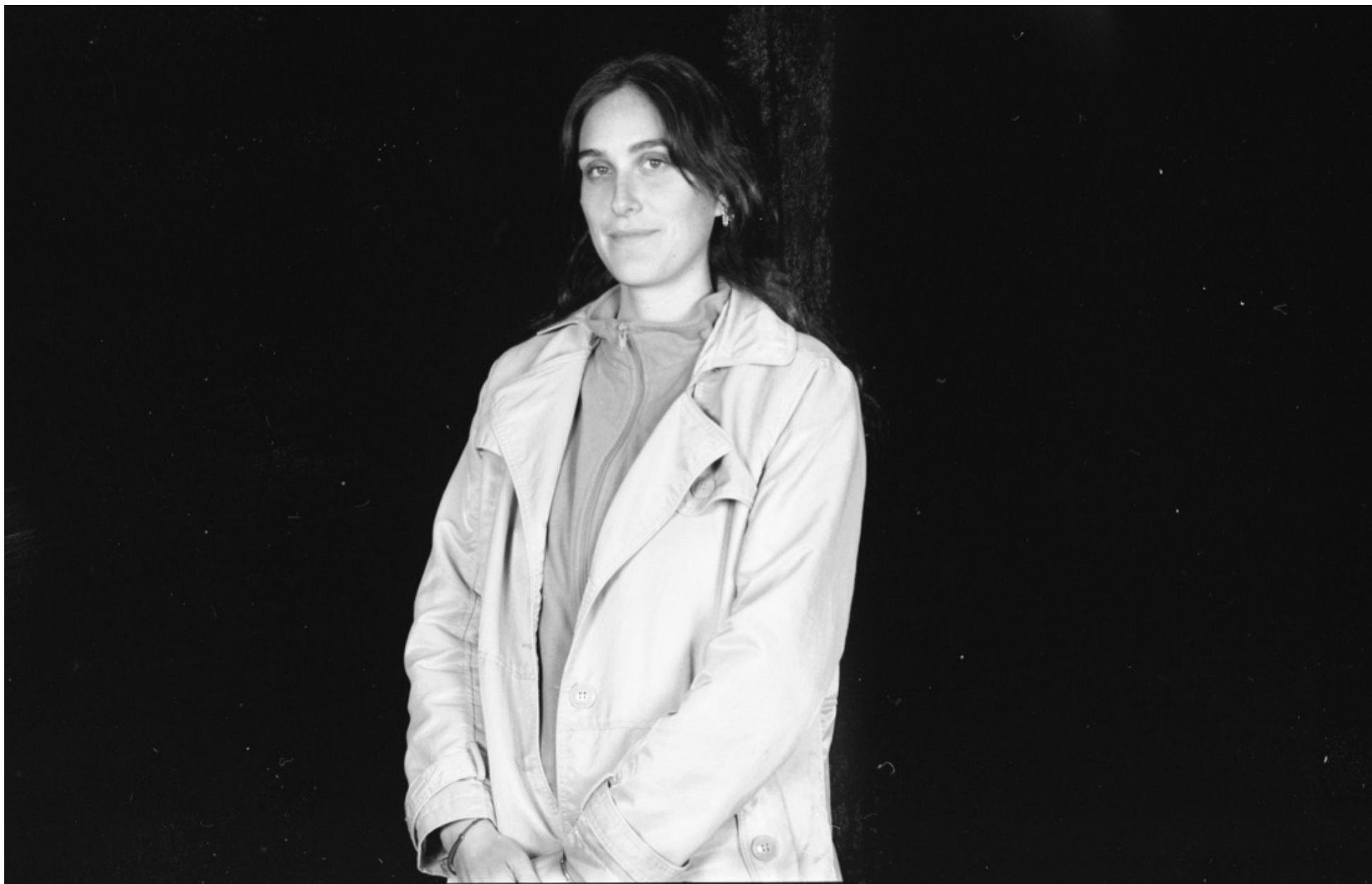
Portrait with artificial light